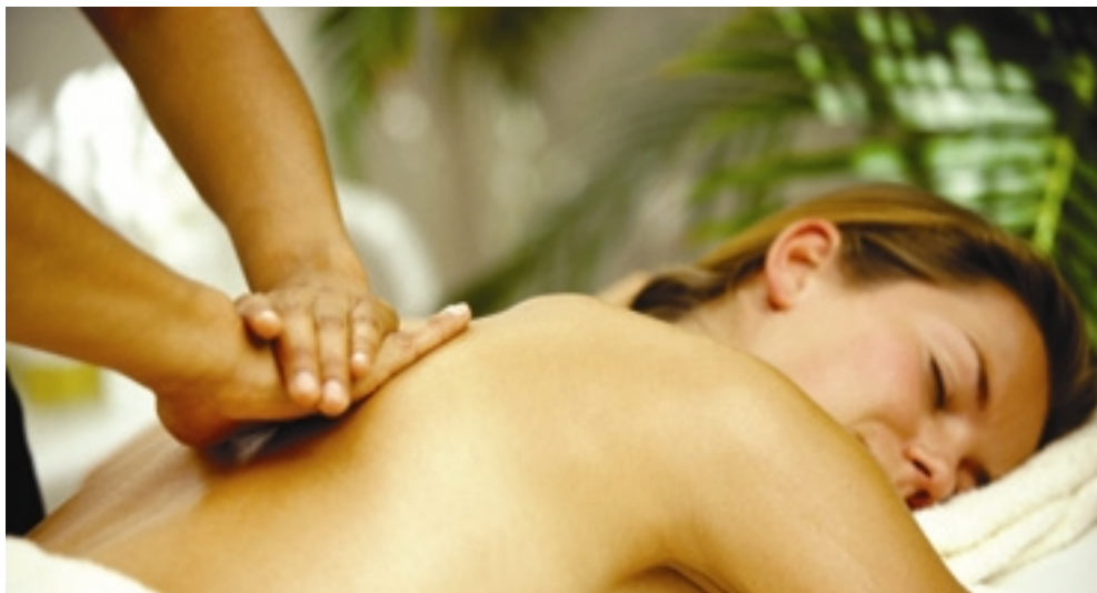
The more often you receive massage, the more therapeutic it becomes.

How often you receive massage depends on why you're seeking massage. In dealing with the general tension of everyday commutes, computer work, and time demands, a monthly massage may be enough to sustain you. On the other hand, if you're seeking massage for chronic pain, you may need regular treatments every week or two. Or if you're addressing an acute injury or dealing with high levels of stress, you may need more frequent sessions. Your situation will dictate the optimum time between treatments, and your practitioner will work with you to determine the best course of action.